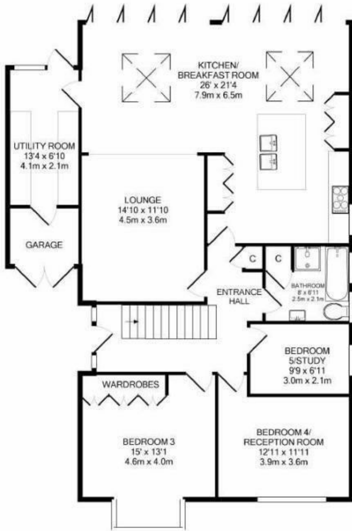
GROUND FLOOR APPROX. FLOOR AREA 123.3 SQ.M. (1327 SQ.FT.)