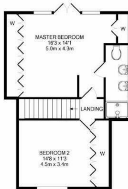
1ST FLOOR APPROX. FLOOR AREA 48.4 SQ.M. (521 SQ.FT.)

TOTAL APPROX. FLOOR AREA 171.6 SQ.M. (1848 SQ.FT.) Measurements are approximate. Not to scale. Illustrative purposes only Made with Metropix ©2015